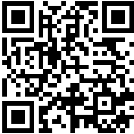
Goralka Law Firm Google Review