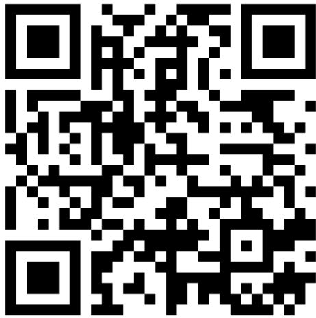
Goralka Law Firm Google Review