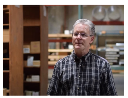
See the video on our YouTube channel: <u>A Multi-Generational</u> <u>Success Story</u>